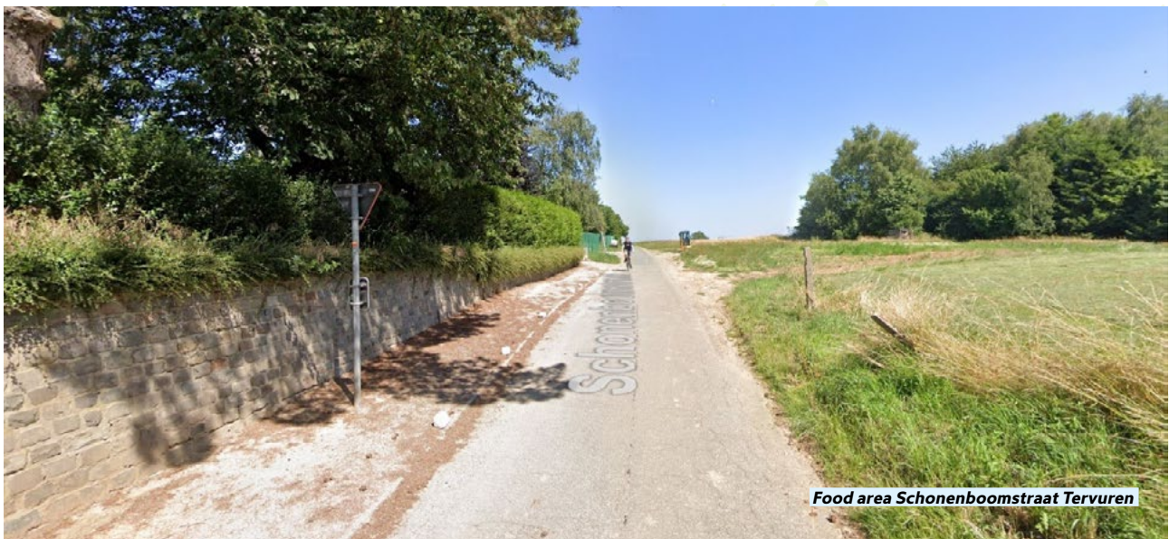
Food area Schonenboomstraat Tervuren