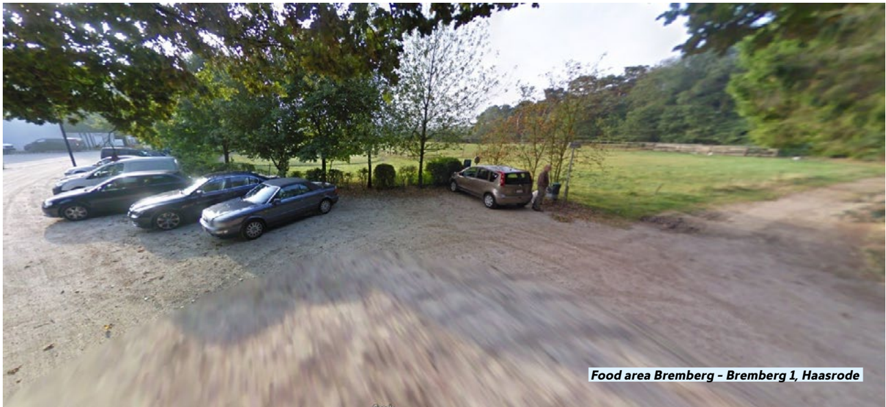
Food area Bremberg - Bremberg 1, Haasrode